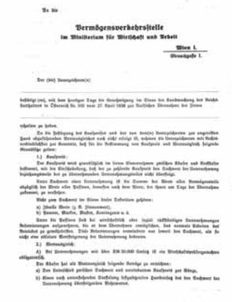
Confirmation of receipt of the approval for the "aryanization" of a Jewish business from the holdings of the "Buerckel-Materie" in the Austrian State Archives