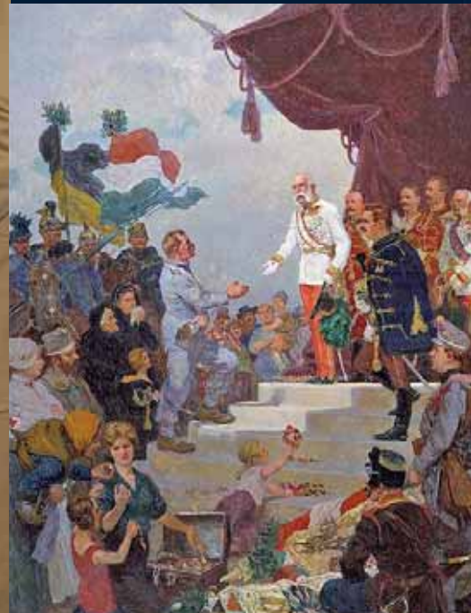
Above right: The art database of the National Fund, online since October 2006 at www.artrestitution.at