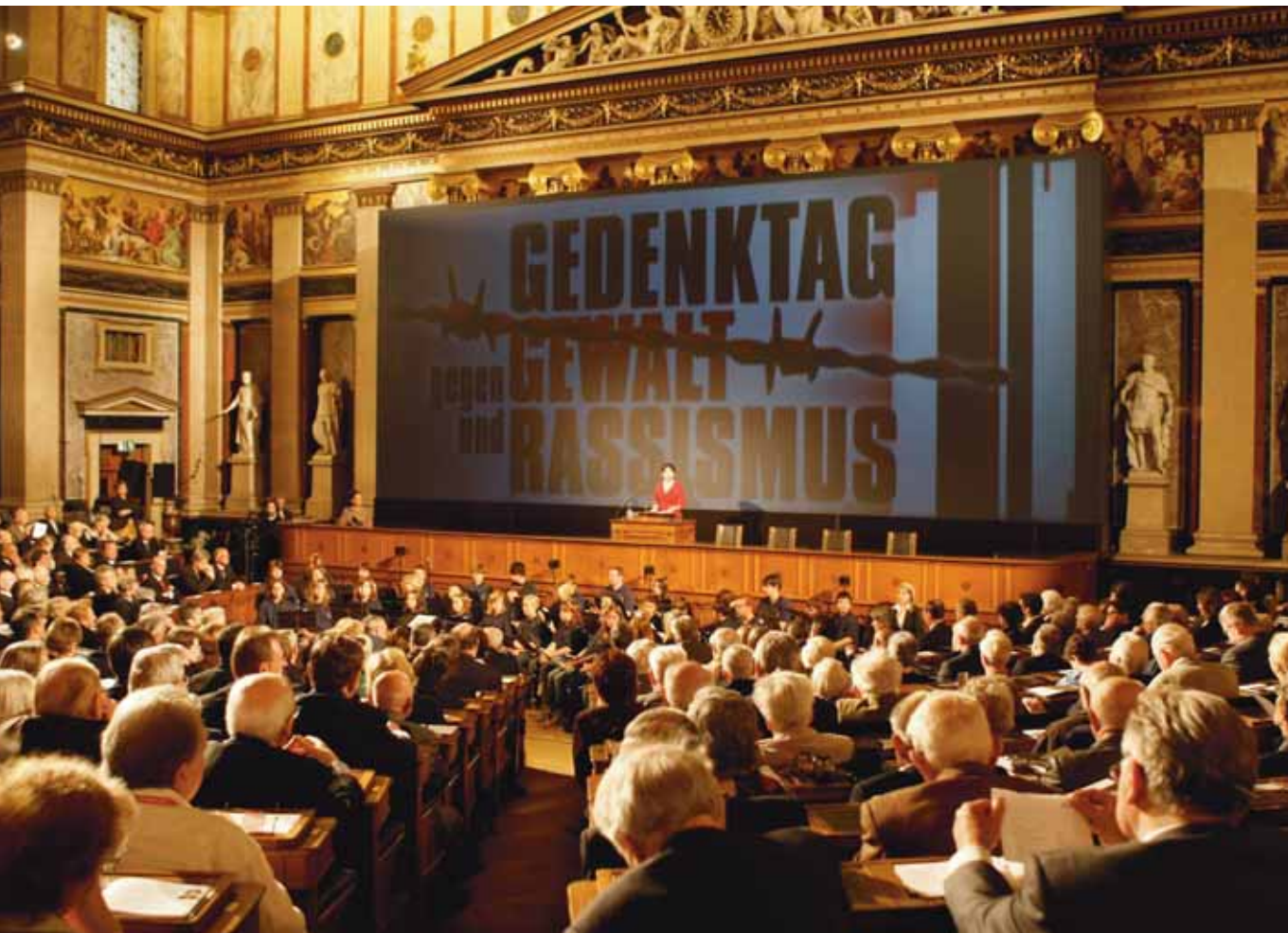
Above and opposite page left: Commemorative event against violence and racism on 5 th May 2008 in the historic assembly hall of the Parliament