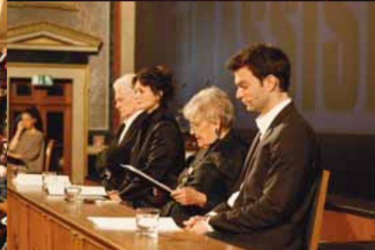
Above right: President of the National Council Mag. Barbara Prammer Below right: Actors from the Volkstheater read excerpts from applicants' life stories