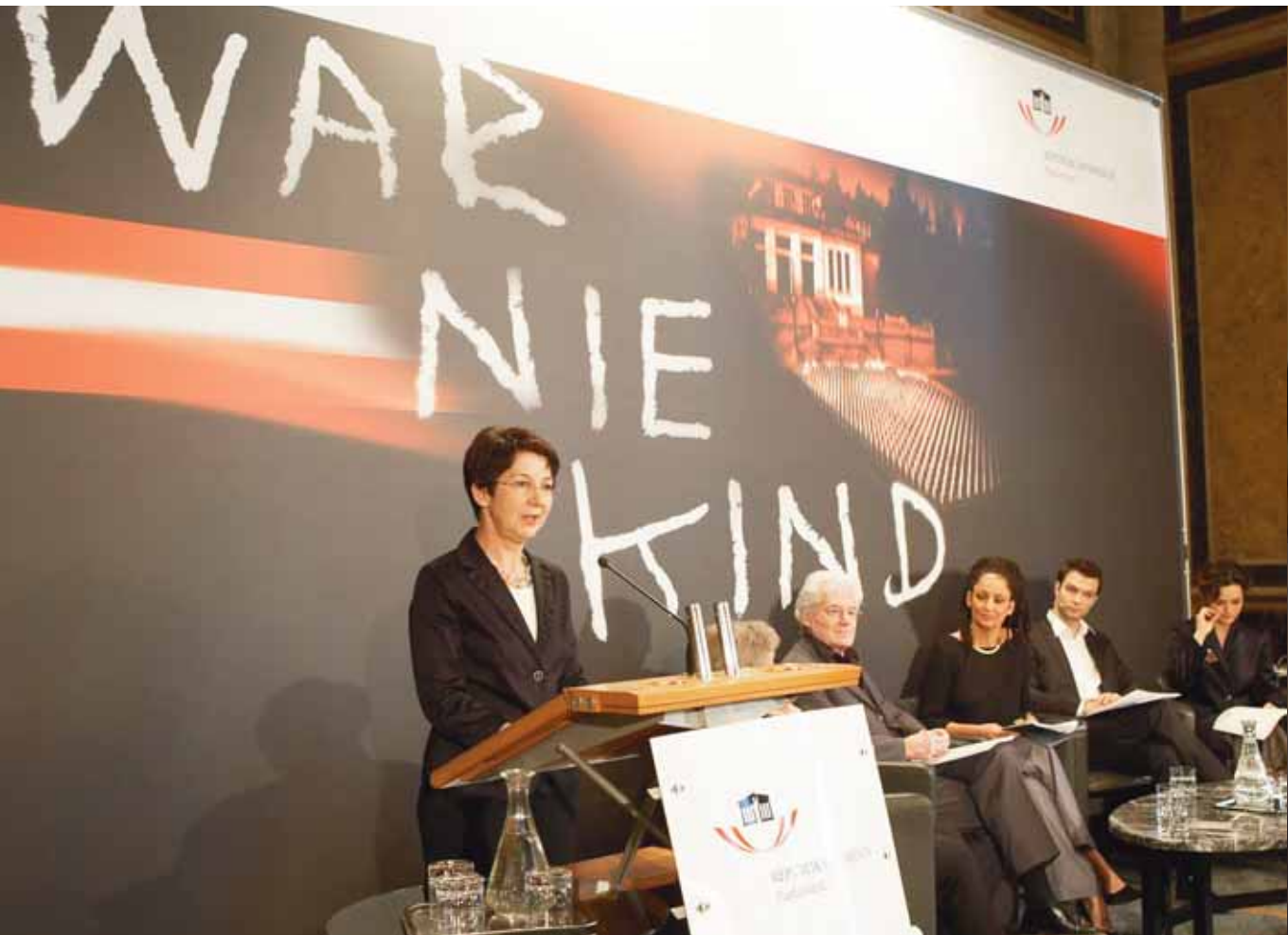
President of the National Council Mag. Barbara Prammer at the matinee War nie Kind... on 4 th May 2008 in the Budget Hall of the Parliament