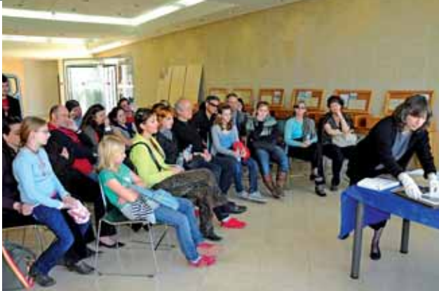
Above left: Yad Vashem, exit area Below left: Presentation of the Austrian archive project at Yad Vashem Above right: The entrance at Yad Vashem Below right: Yad Vashem, entrance hallway