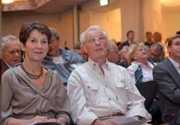
Left and above right: "What was legal then..." – Soldiers and Civilians before the Courts of the German Armed Forces", exhibition opening on 1 st September 2009, Theater Nestroyhof Hamakom