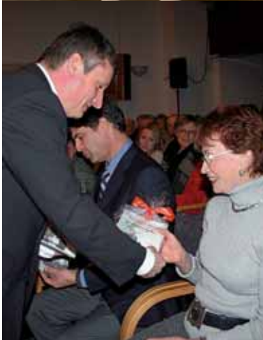
Left from top to bottom: Festivities marking the opening of the bilingual exhibition Tu smo bili doma. O judovski družini Scharfberg v Železni Kapli / We belonged here ... The Jewish family Scharfberg in Eisenkappel, 28 th March 2008 Galerie Forum Zarja, Bad Eisenkappel/Železna Kapla