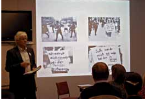
Teachers' seminar _erinnern.at_