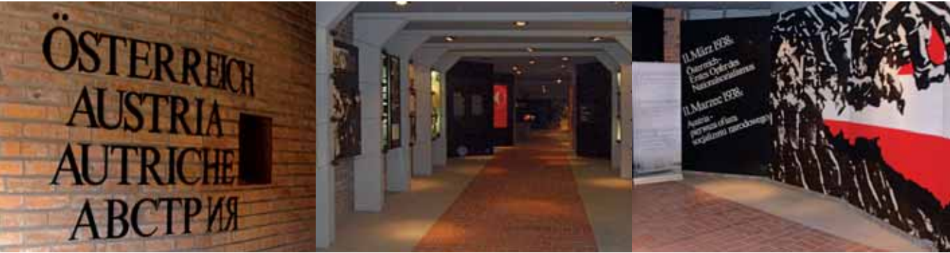
Left: View of the foyer