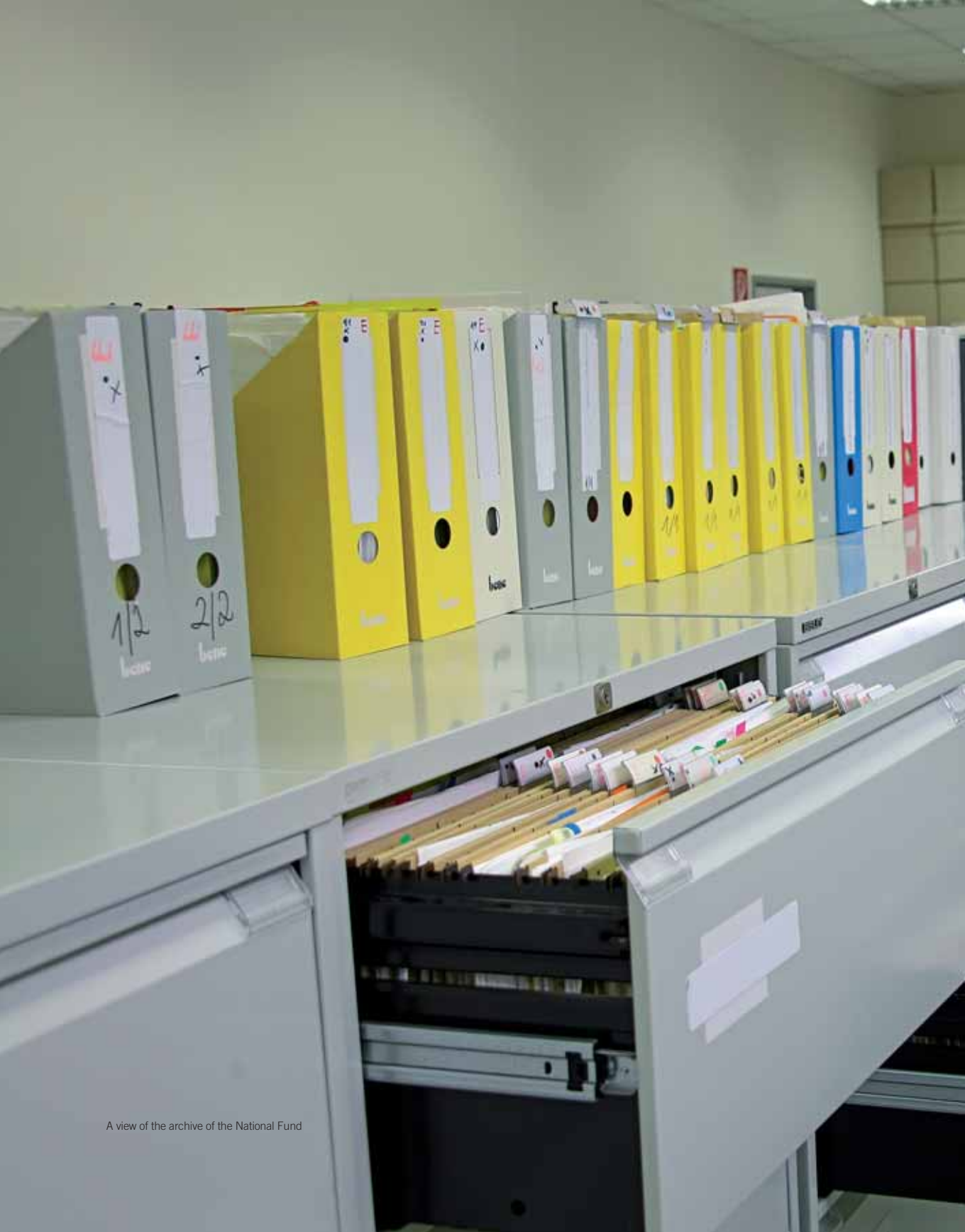
A view of the archive of the National Fund