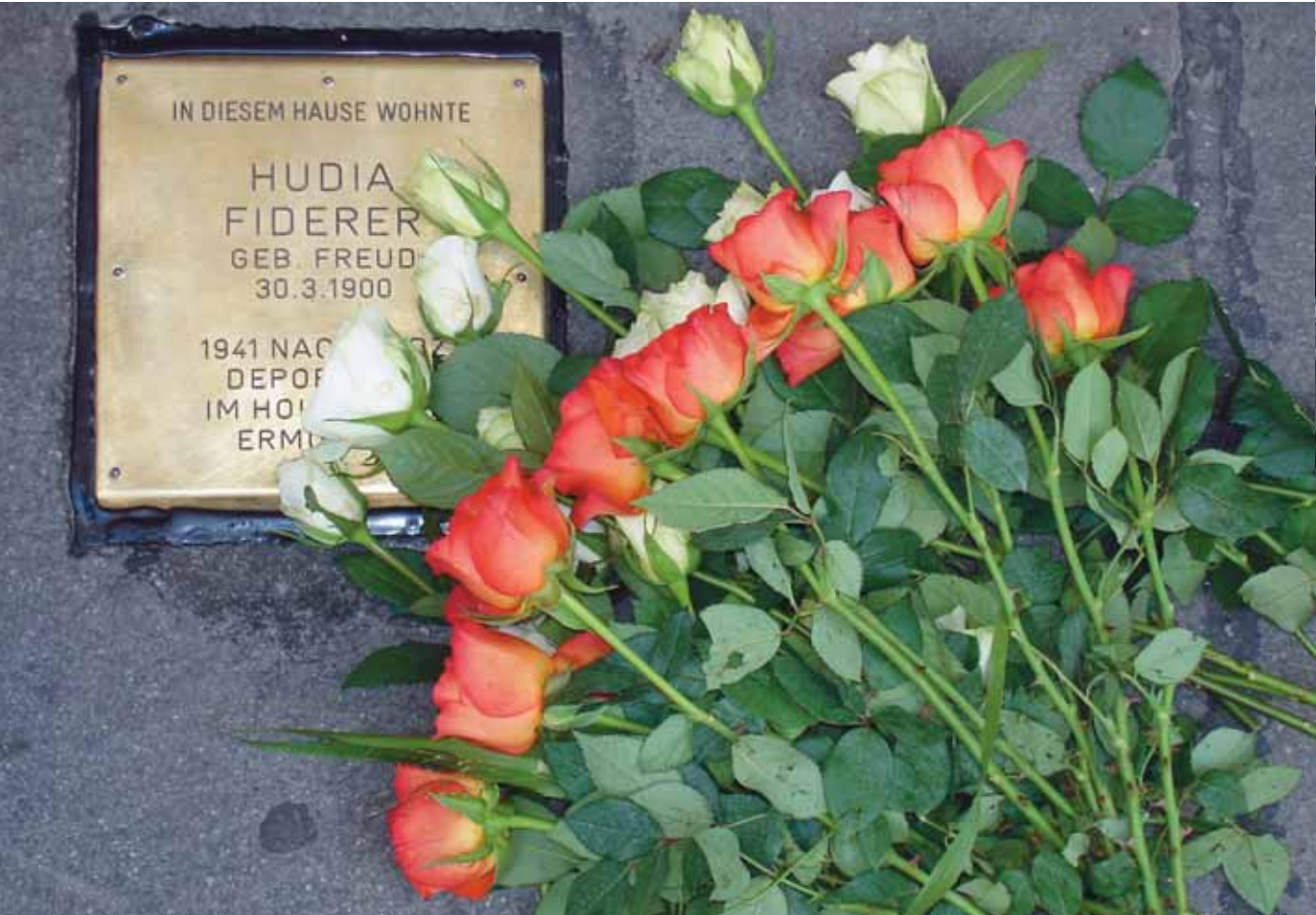
Stones of remembrance for Jewish victims of the Holocaust "Stone of remembrance" at Kandlgasse 44 in the 7 th district of Vienna