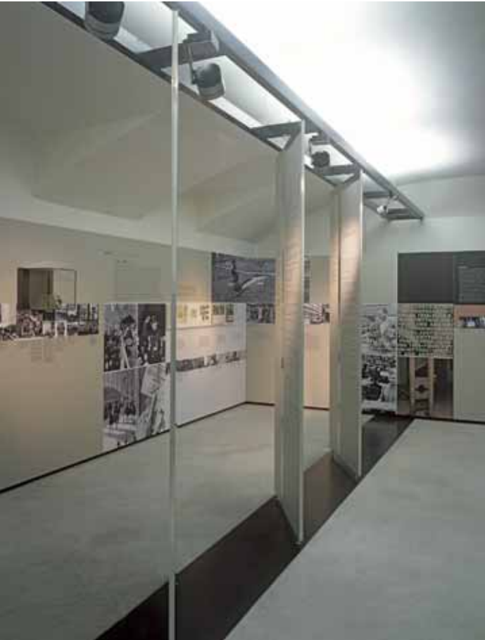
View of the permanent exhibition of the Documentation Centre of Austrian Resistance, Altes Rathaus, Vienna