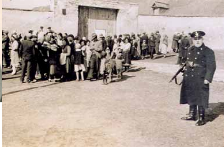
Photographs from the project "Mri Historija"