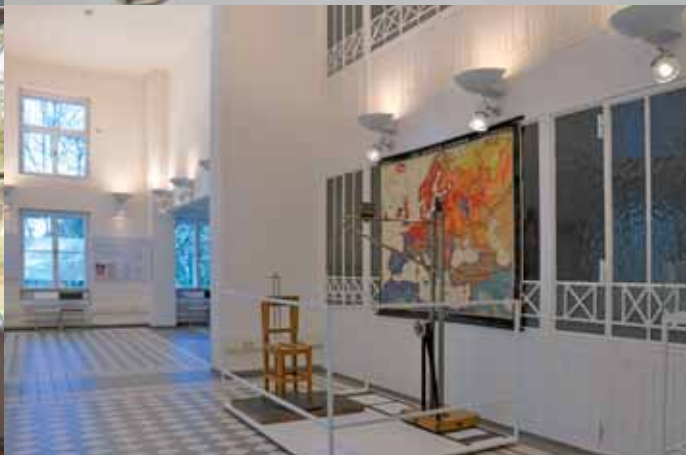
The permanent exhibition of the Documentation Centre of Austrian Resistance "The war against the 'inferiors'. The story of National Socialist medicine in Vienna" in the Otto-Wagner-Hospital (Vienna)