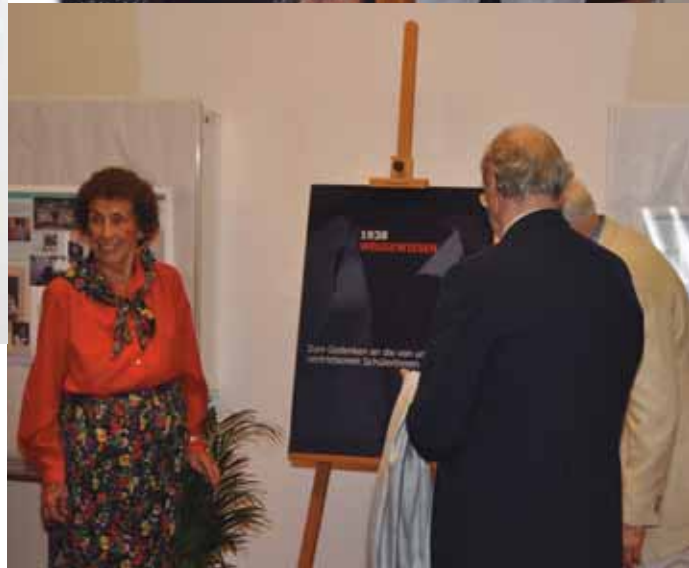
Above: Memorial plaque at the BRG 7