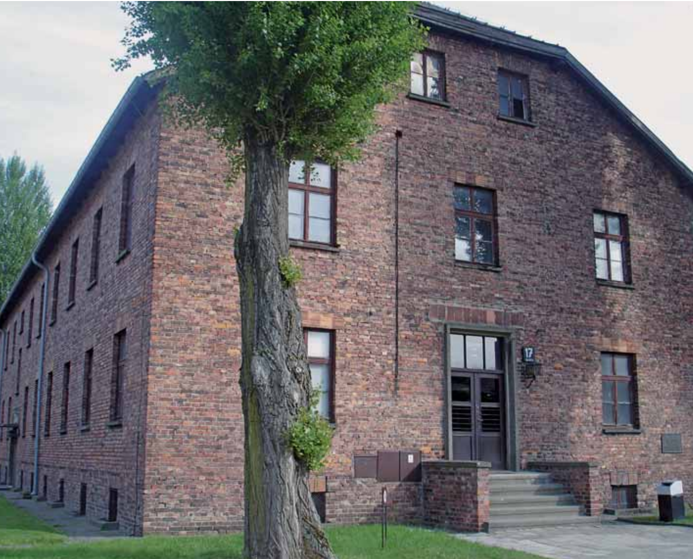
Exterior view of block 17, in which the exhibition is located