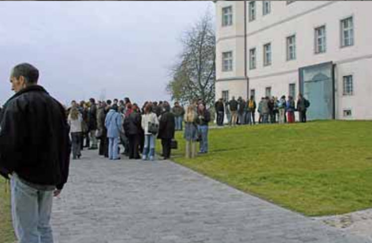
Right: Glass panels containing the names of those murdered at Hartheim Above left: Further education program for the guides/educational staff of the Educational and Memorial Site Schloss Hartheim Below left: School students at the Educational and Memorial Site Schloss Hartheim